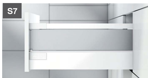
S7 High-fronted drawer with single gallery & Design element (D); Height: 199 mm