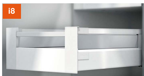
i8 Inner drawer with single gallery & Design element (C); Height: 167 mm