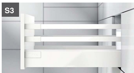
S3 High-fronted drawer with double gallery; Height: 199 mm