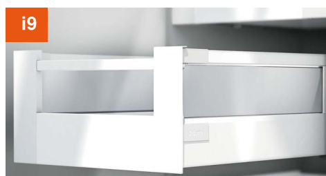
i9 Inner drawer with single gallery & Design element (D); Height: 199 mm