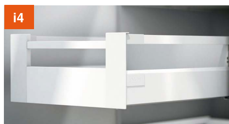
i4 Inner drawer with single gallery; Height: 167 mm