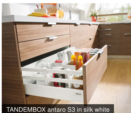
TANDEMBOX antaro S3 in silk white

TANDEMBOX antaro pull-out system is characterised by single or double rectangular gallery rails. By using these angular elements and by harmonising the colour of all fittings components, we have created a system that is a clear alternative to TANDEMBOX plus.