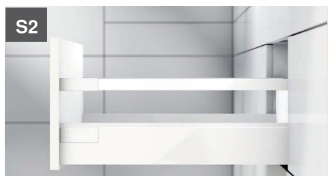
S2 High-fronted drawer with single gallery; Height: 167 mm