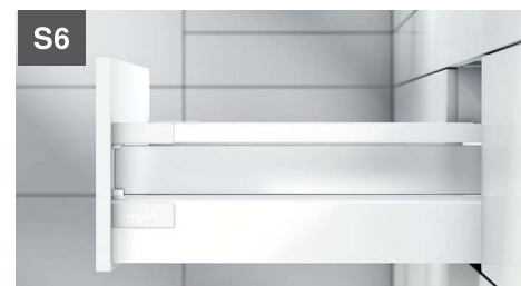
S6 High-fronted drawer with single gallery & Design element (C); Height: 167 mm